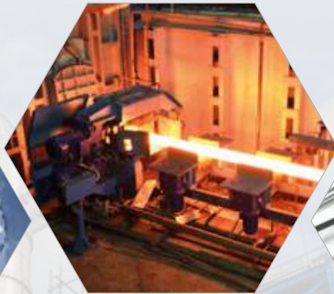
Rolling Mill Industry